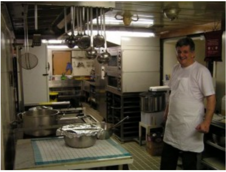
Keep galley clean and tidy

The galley room, mess room and stores are to be kept clean. The extend and specific details of the cleaning and disinfection should be documented in a corresponding plan.