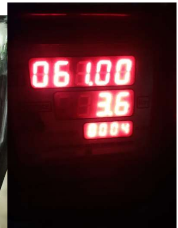
22 nd 1904