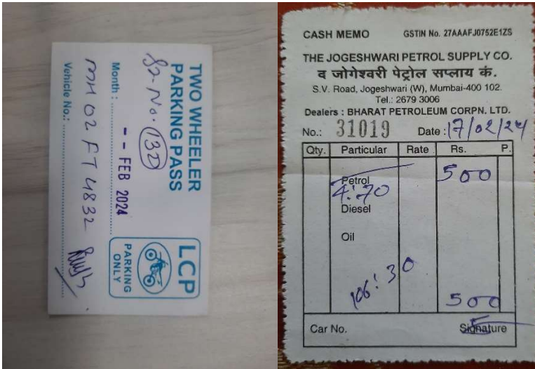
Bike Parking Feb