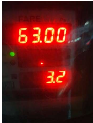
28 th 1842