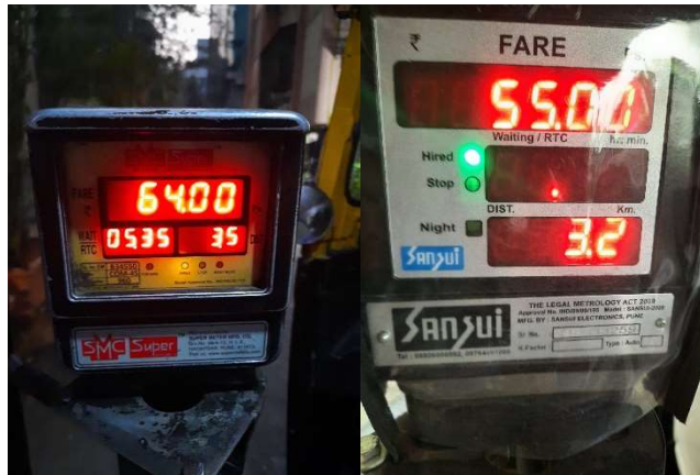
26 th 1902