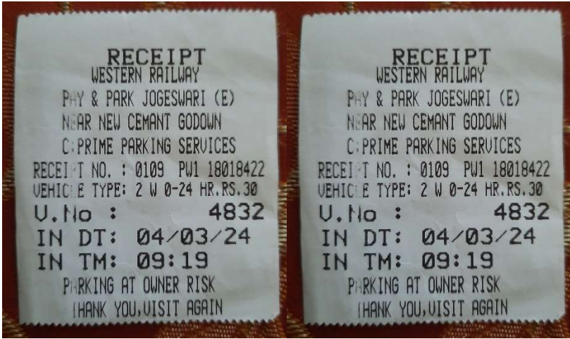
04 th Mar