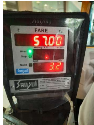
27 th 0948