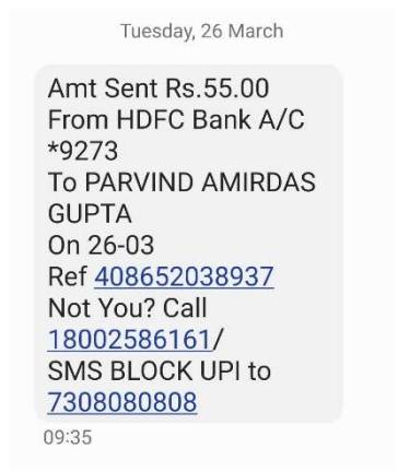
26 th 0935